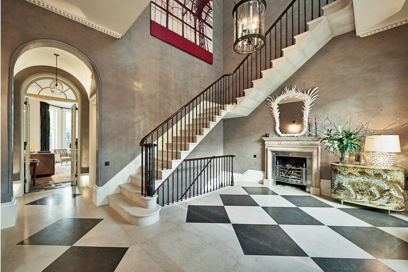
Private residence, London Hallway, fireplace and staircase